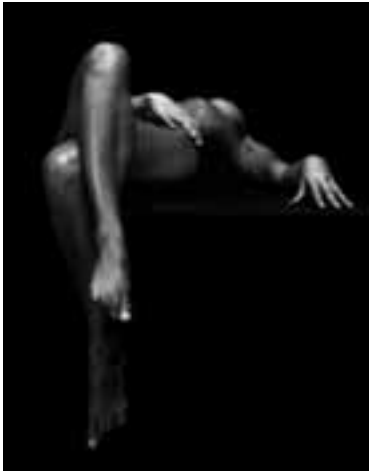
Suspended by Maureen Gallagher • 7¾" x 9¾" • limited to 250 • signed • introductory price $99 plus shipping and handling • No. LPG-003