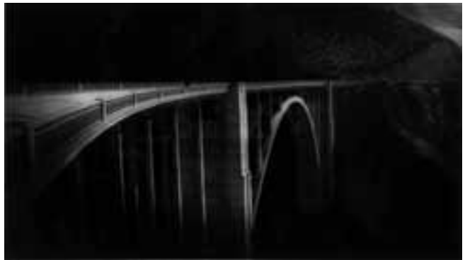
Bixby Creek Bridge, Big Sur, CA, 1996 by Larry Wiese • 9" x 16" • limited to 250 • signed • introductory price $175 plus shipping and handling • No. LPG-002

If you are unfamiliar with photogravures, our sample print, Driver, SP&S 700 by Russ Dodd includes a $25-off coupon that can be applied to your next photogravure purchase!