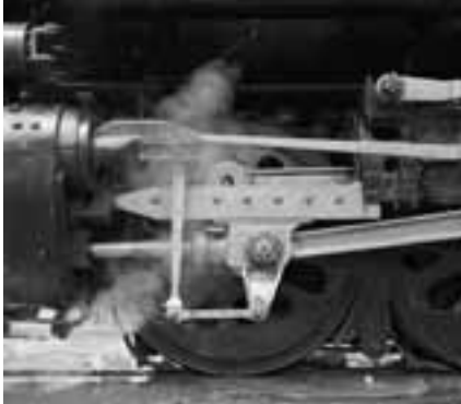
Driver, SP&S 700 by Russ Dodd • 7½" x 8¾" • limited availability • signed • introductory price $39 plus shipping and handling • No. LPG-SA1