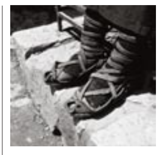
84 End Notes by Bill Jay

Portfolio: Mario DiGirolamo Sole E Ombra: Images of Italy